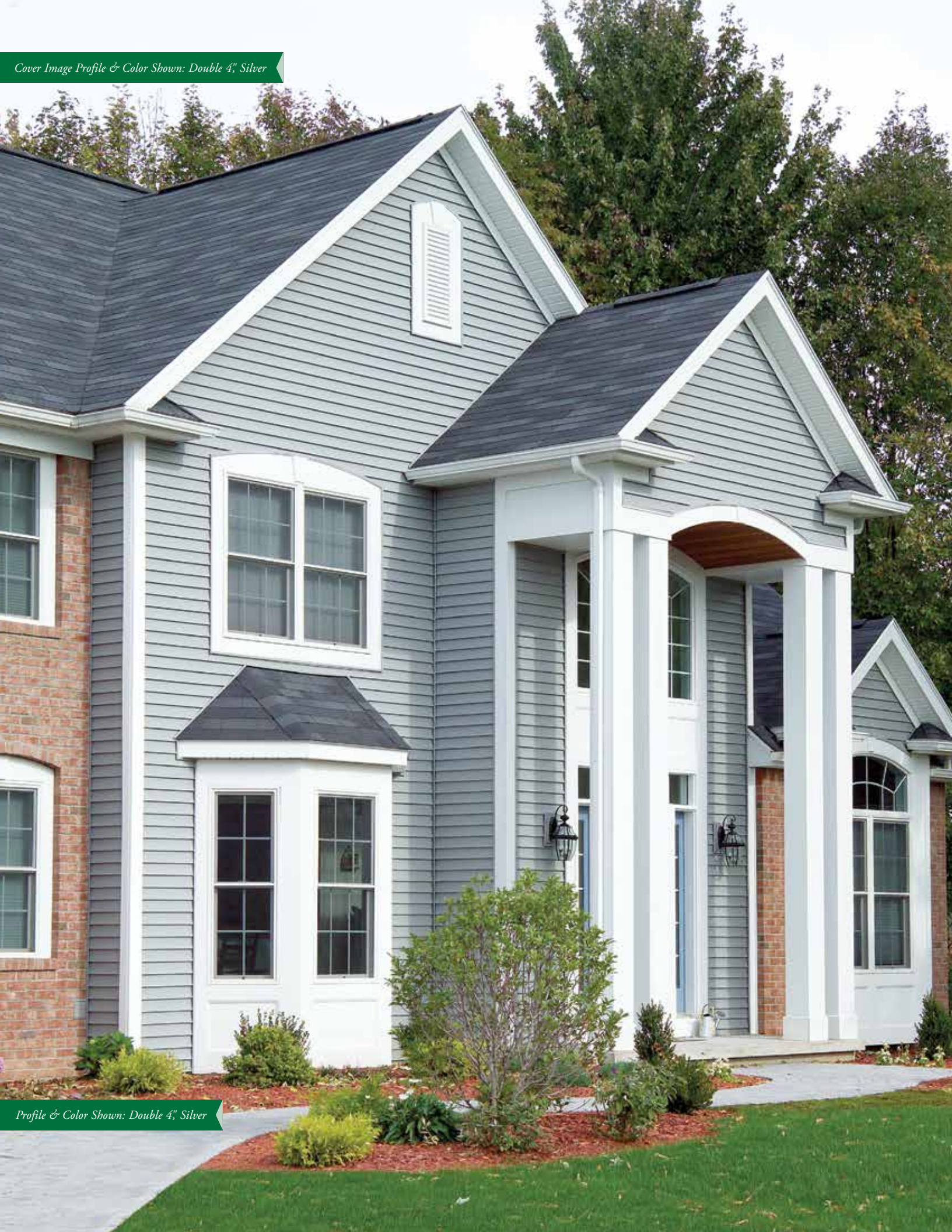
Profile & Color Shown: Double 4," Silver