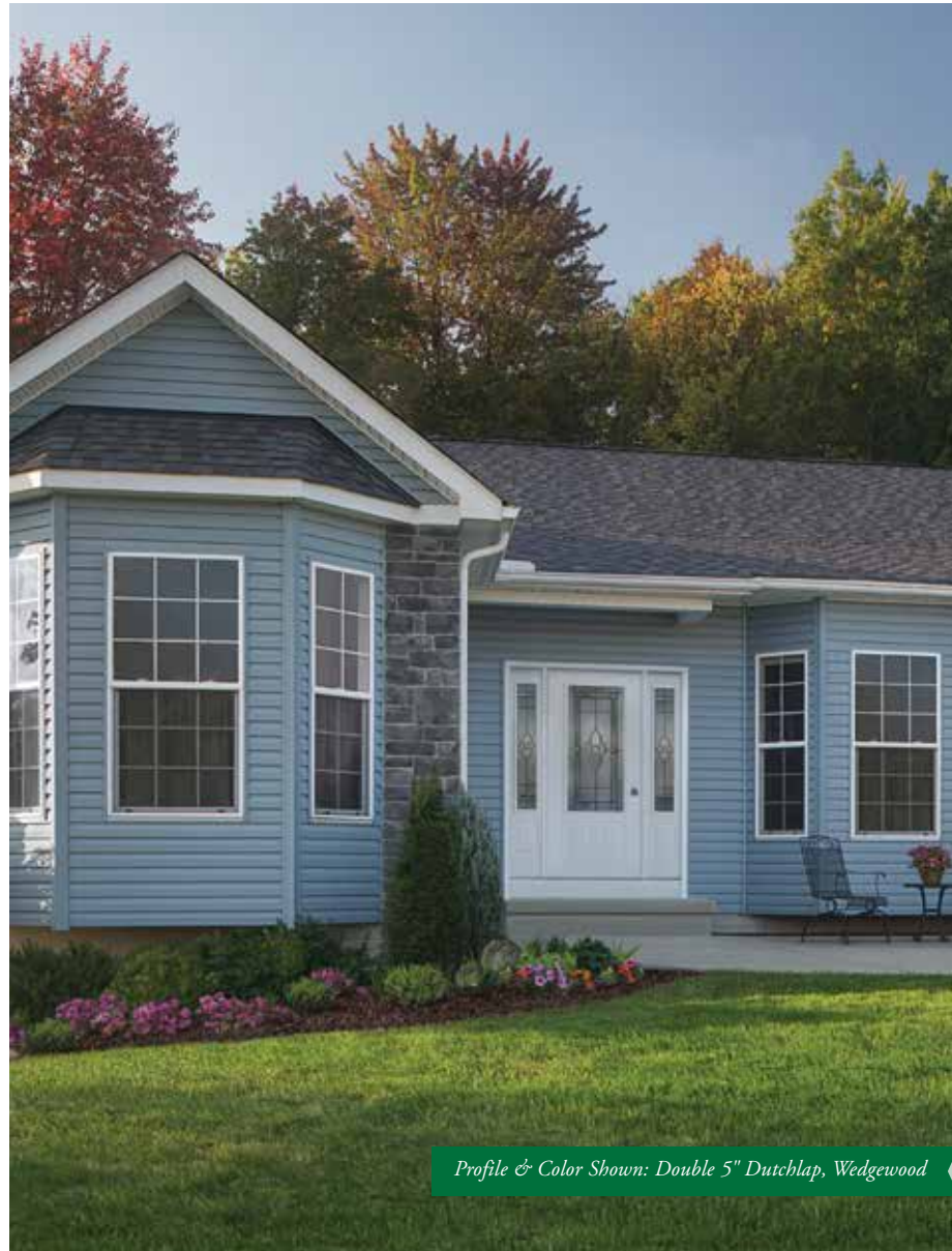
Profile & Color Shown: Double 5" Dutchlap, Wedgewood