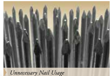
Unnecessary Nail Usage

NailRIGHT helps guide the installer to the studs for an installation that's strong, secure and resistant to blow offs.